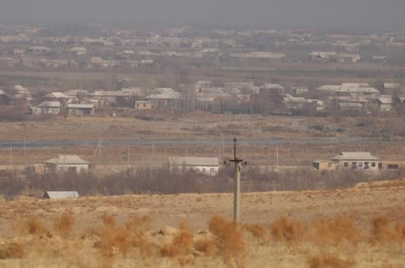
Figure 2-1. View to the centre of the site (Left) and Zarafshan river to the north of the site (Right)